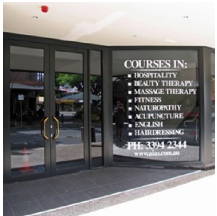
The main entrance to the new AIAS campus at 337 Logan Road, Stones Corner. This opens to a spacious and very modern foyer.